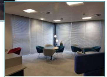
Internal Office View