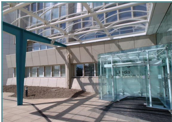
North West's leading breast cancer facility