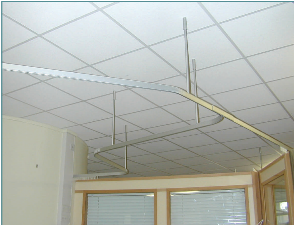
Cubicle track systems all formed to site requirements