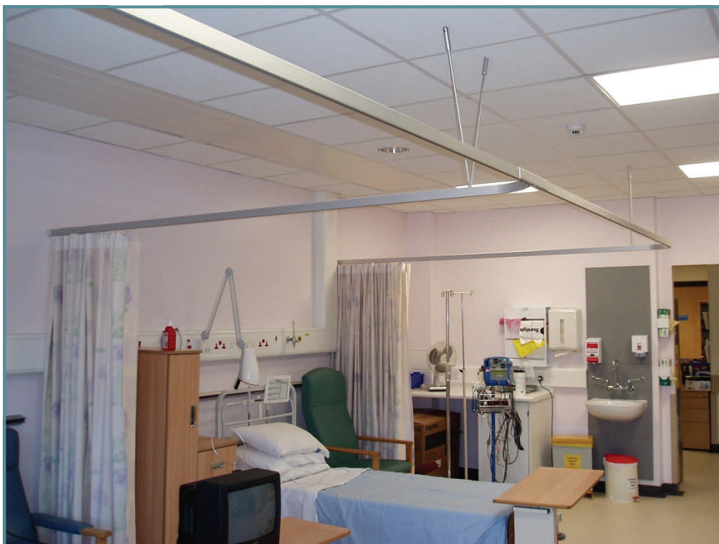
Typical ward layout

Please contact us for more reference sites or any further information