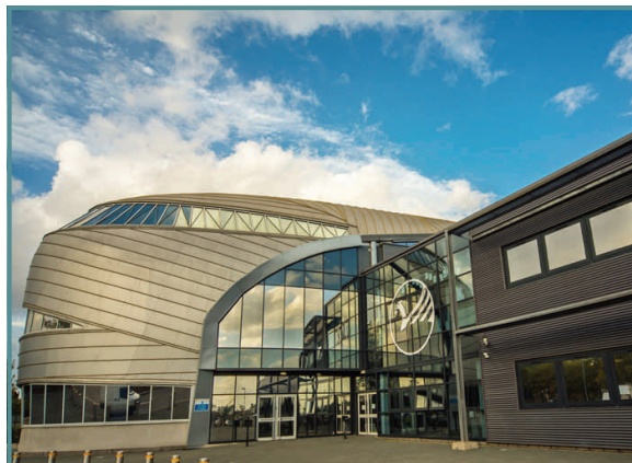
The new North Liverpool Academy building