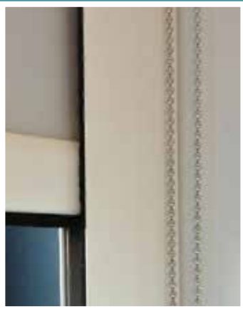
Side chain operation