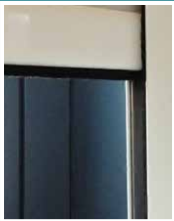
Heavy duty side channels