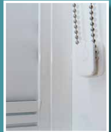
Chain tension device