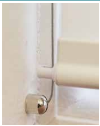
Side guide wires