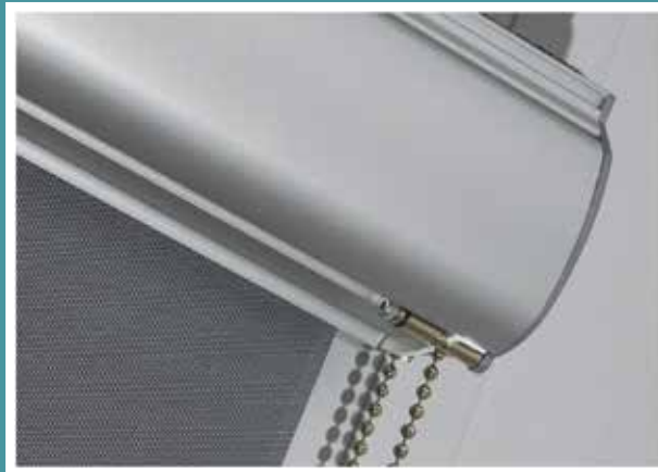
Headbox cassette to conceal roller