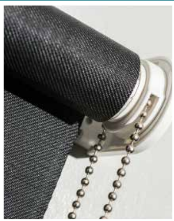
Side chain operation