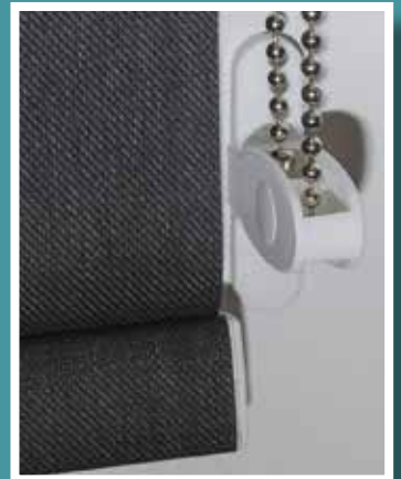
Chain tension device